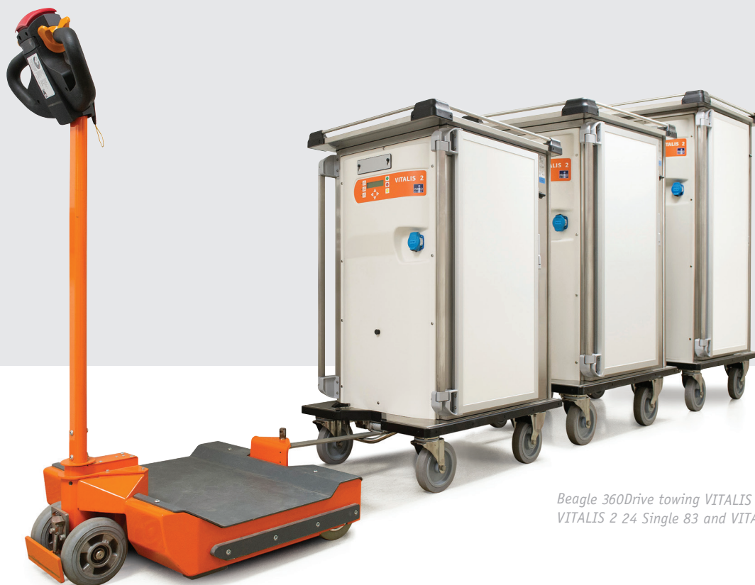
Beagle 360Drive towing VITALIS 2 16 Single 83, VITALIS 2 24 Single 83 and VITALIS 2 30 Single 83

Sustainability is a leading principle within ISECO St-Phal. This is reflected in all aspects of our company: products, technology, buildings and production methods.