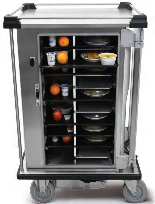
VITALIS 2 20 Fresh 98 (integrated refrigeration) with optional black trays

Delivering near-perfect quality and temperature, every time. Maintaining the high quality of the meals you prepare.