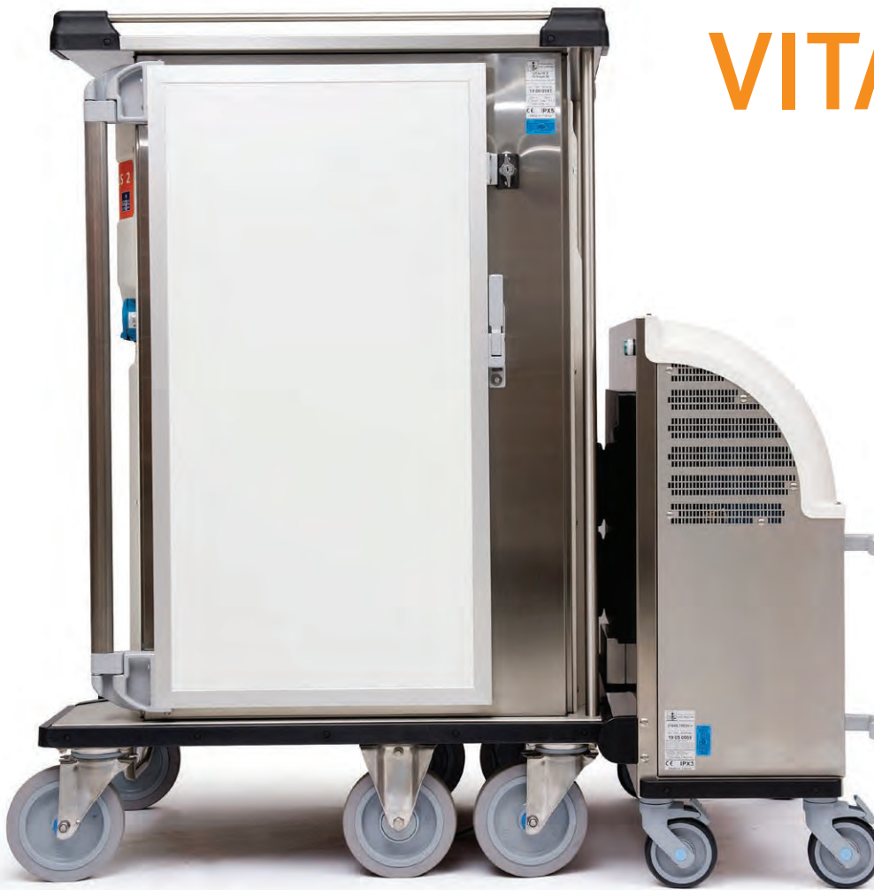
VITALIS 2 20 Single 98 with STAND Fresh™ separate refrigeration unit